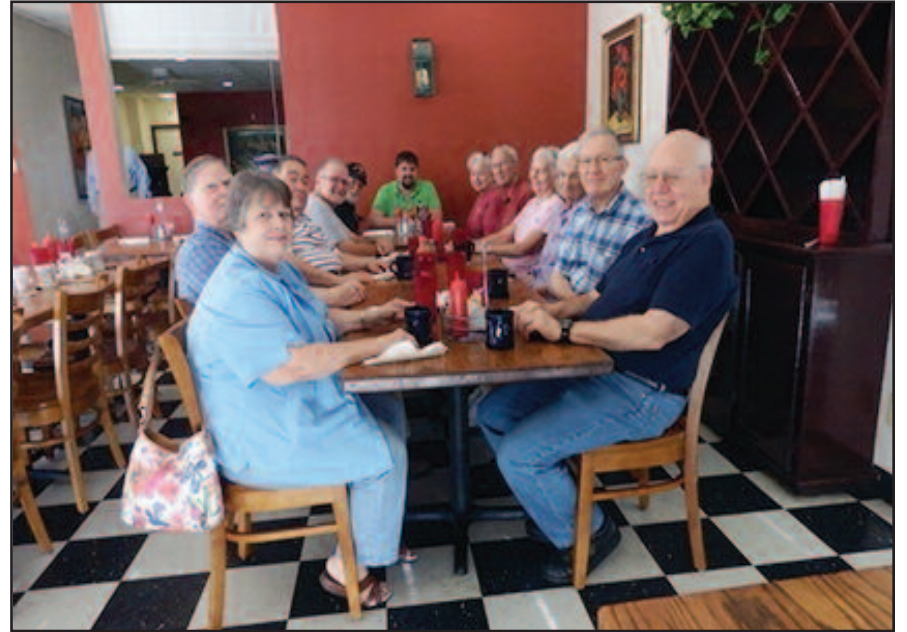
TIAA members and their families get together for our TIAA Breakfast at Southern Recipe Cafe every third Friday of the month.

trips, and I've enjoyed every one of them." He further stated, "This event was very informative. This is the first time I've been in this new building and I'm very happy to see what they are doing here and learn about the research that's going on."