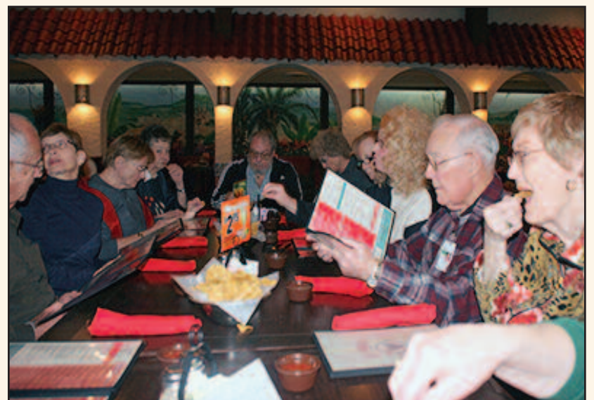
Eating together is one of the enjoyable aspects of our Travel events. Members ate at El Fenix following our visit to the Perot Museum on January 21.

All trips depart from and return to the Dallas Texins Activity Center unless otherwise noted. Meals are at participant’s expense. Each TIAA member may bring one guest at the member price. Others may join us at the nonmember price. To register online, please go to tialumni.org/trip , click on the desired event, then on Event Registration Page and follow the instructions. You can pay by credit card through a secure link or mail your check to TIAA, PO Box 740181, Dallas, TX 75374. You can also register by contacting the TIAA office at admin@tialumni.org or 214-567-8444. Please register at least seven days before the event, so that we can inform you if plans change.