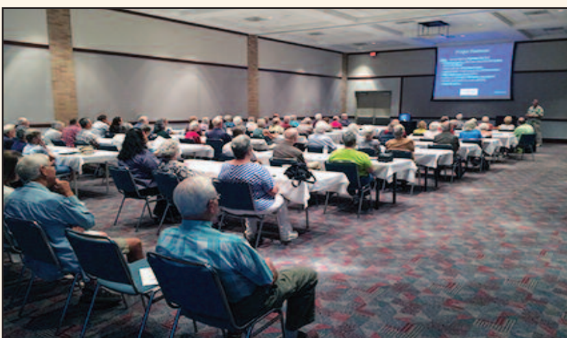
More than 90 members attended the Health & Aging Seminars in Plano and Oak Cliff on June 4 and June 10, respectively. This was the first time recently that TIAA held the same seminar in both North and South Dallas to reach as many members as possible.

To participate in the campaign go to www.tialumni.org/utd-biomed for detailed instructions for downloading the donation/pledge form, where to mail, and how to request a matching gift from the TI Foundation. We plan to complete the campaign by the end of 2014. Please contact the TIAA office at admin@tialumni.com or 214-567-8444 if any help is needed in making a contribution to this worthwhile program.