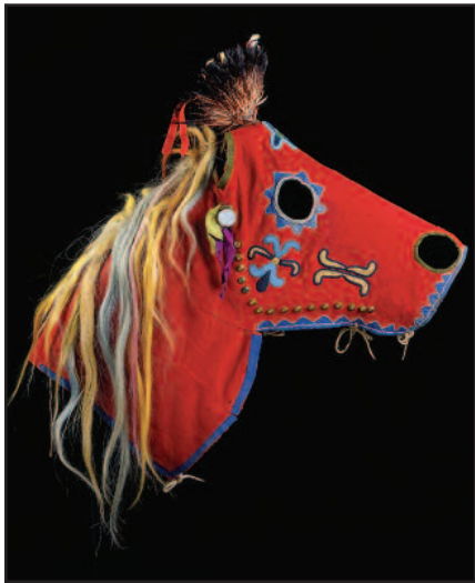
This colorful Nez Perce Horse Mask, 1875-1900 ca., is an example of the items on display at the DMA from the Thaw Collection.