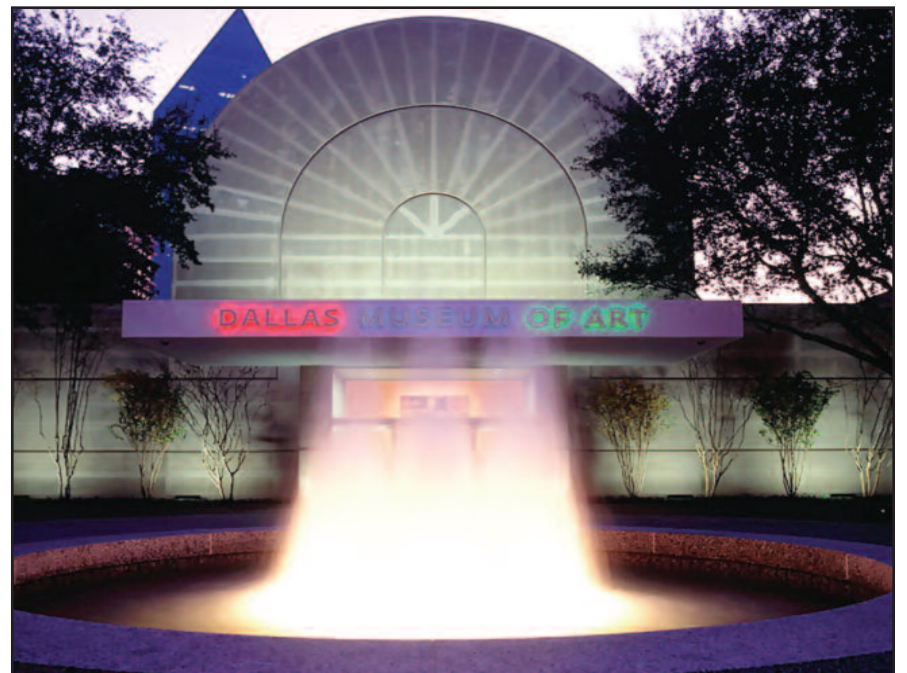
Night view of the fountain and Ceremonial Entrance of the Dallas Museum of Art.

Don't miss this opportunity to visit with friends, enjoy refreshments, and view some of the many jewels in the DMA collection, including paintings by Monet, Degas, Pissarro, Winston Churchill, Georgia O'Keefe, and several works from the McDermott Collection