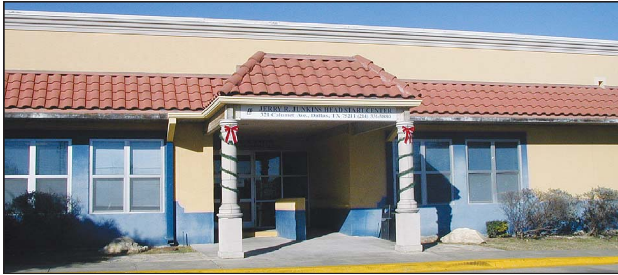
TIAA volunteers will work at the Jerry R. Junkins Head Start Center to bring the facility back to its original condition.

The Jerry R. Junkins Head Start Center, has served hundreds of preschool children since being built in