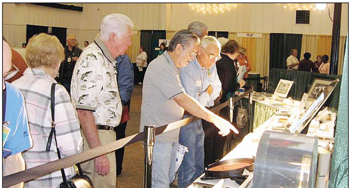
Big Event attendees enjoy TI historical artifacts exhibit.