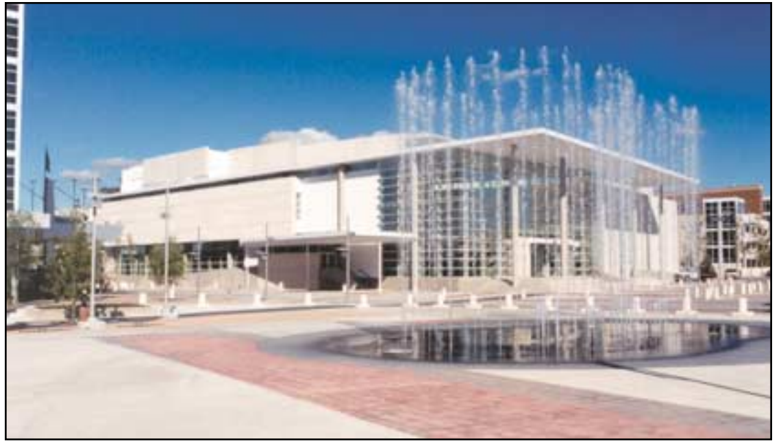
The impressive new Charles W. Eisemann Center for Performing Arts and Corporate Presentations is the site of the next TIAA annual meeting, set for May 22.

Owned and operated by the City of Richardson, the Eisemann